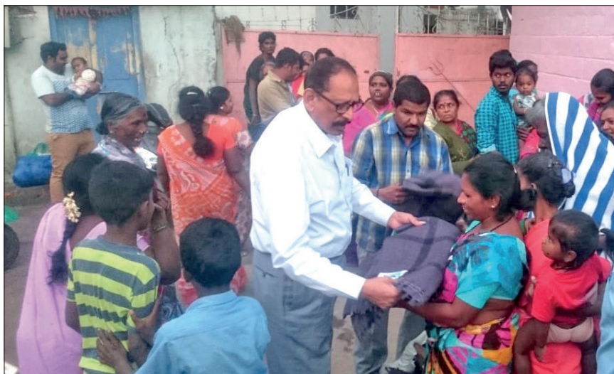
The drive was held in Nagarbhavi, Majestic, City Railway Station and other spots

Retired police personnel distribute blankets to homeless people in city